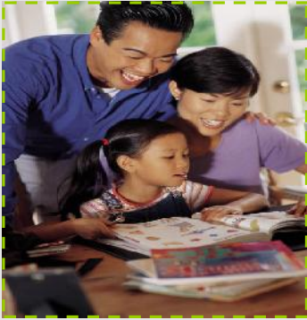
Children need to be monitored

The use of porn has precipitated a crisis in our society and in our Church!