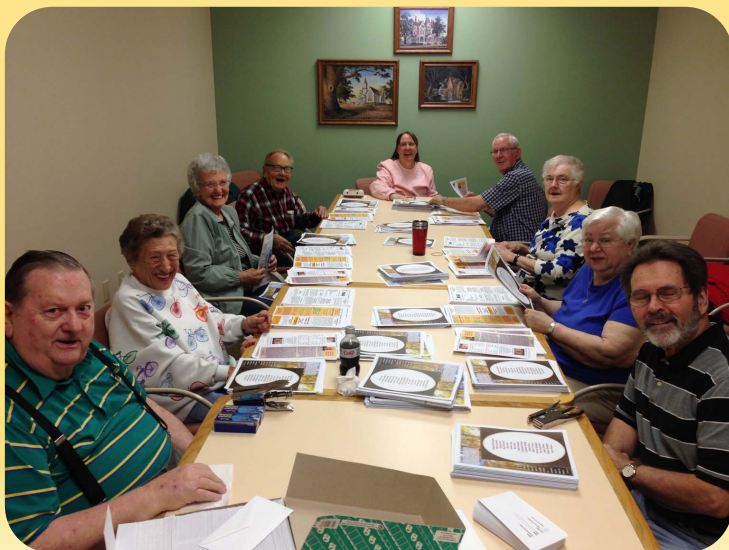
(These faithful volunteers give of their time every week that we might have our wonderful bulletin.)